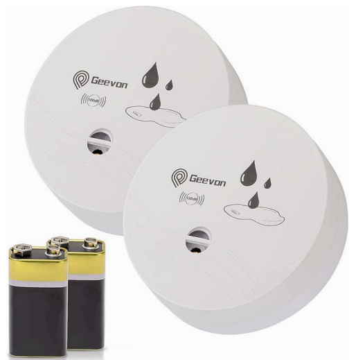
Geevon 2 pack Water Leak Detector 100dB Alarm (Battery incl.) $12.95 Amazon

This will save you headaches and money. It is a water leak detector. Put it under your sink or behind your refrigerator or washing machine. If water touches the sensors on the bottom, it starts beeping. It saved me the charges of a plumber and the cost of an expensive floor repair. Inside is a changeable 9 volt battery. My pair, one year old, still work with the original batteries. The ones I have, pictured here, are from Amazon. There are many different kinds including ones that send a signal to your phone. These alarms are also available from PPD. PAULA SEEBODE