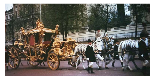
Her Majesty's Golden Coach