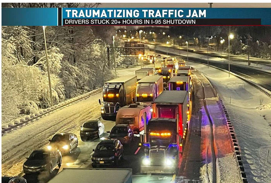
TRAUMATIZING TRAFFIC JAM DRIVERS STUCK 20+ HOURS IN I-95 SHUTDOWN