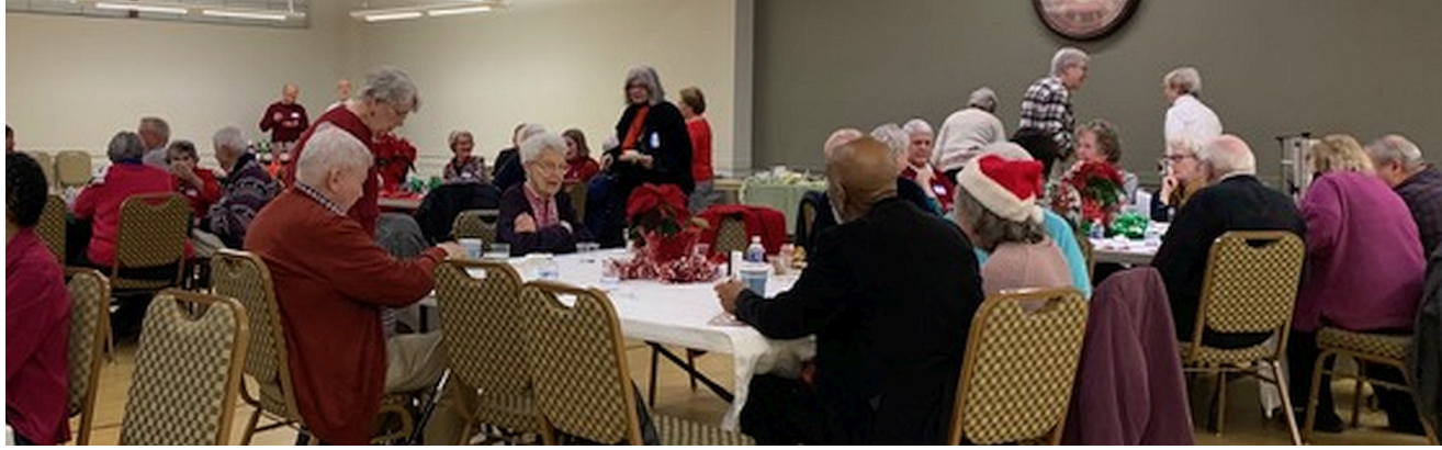
Food, Friends, Festivities, and Fun